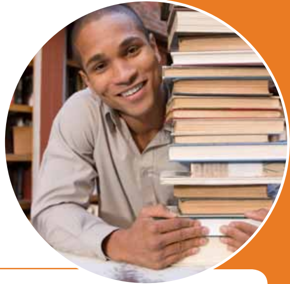
Typical Reading Demands of Materials in English